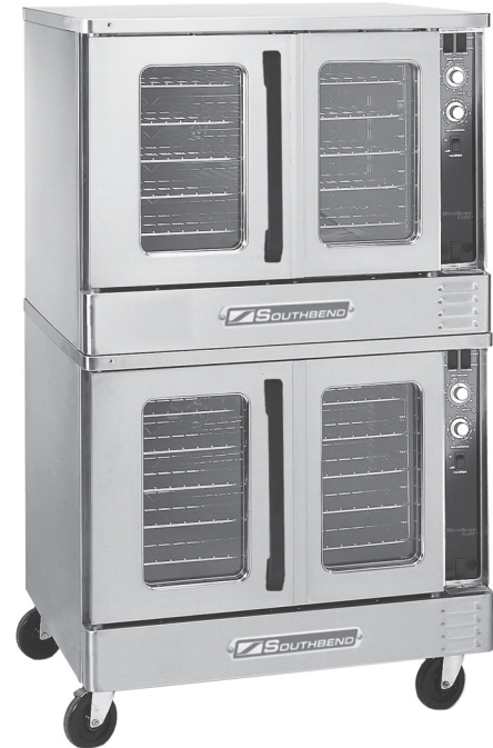
(shown with optional casters)

150°F to 500°F temperature controller with 140°F to 200°F "Hold" thermostat Dual digital display shows time and temperature. A fan cycle timer pulses the fan.